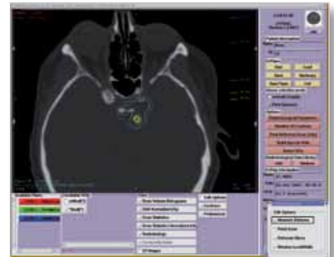
Leksell GammaPlan doseplan exported to Ergo++ planning software.