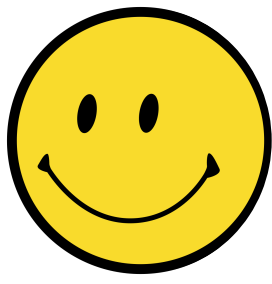
OPEN PAC Manager